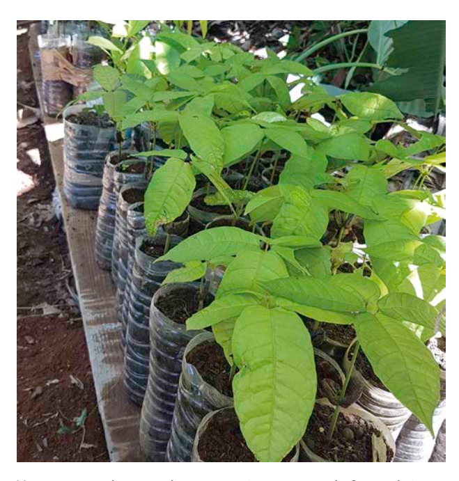
Young cocoa plants in the nursery (approximately 2 months).

• Entrepreneurship initiatives to support the creation of processing and marketing structures, for raw and finished products, in Guadeloupe and Haiti. These marketing approaches will become part of a strategy for a more social and solidarity economy, and for fairer trade.