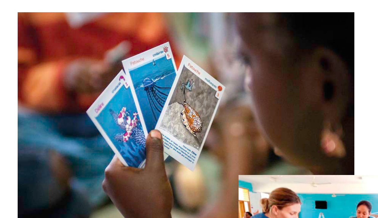
Educational kit to learn about the coral reefs.

of research programmes. This kit aims to convey scientific knowledge about the corals in a fun and educational way. Each class participating in PAREO receives a kit to be explored during the year.