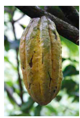
Criollo variety pod.