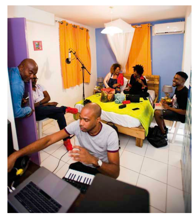
TEECA Caribbean Music Camp 2: TEECA beneficiaries, Martinican producer, and guest producer from the US working together during a writing session.