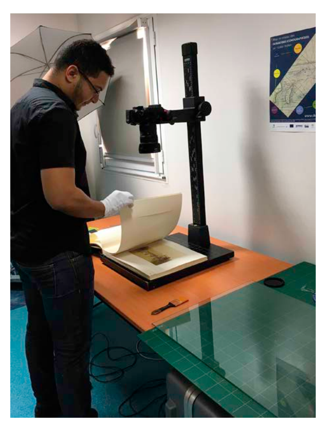
Digitalisation of a book for the IHOI.

https://www.ihoi.org/app/photopro.sk/ihoi_icono/home?&lang=eng