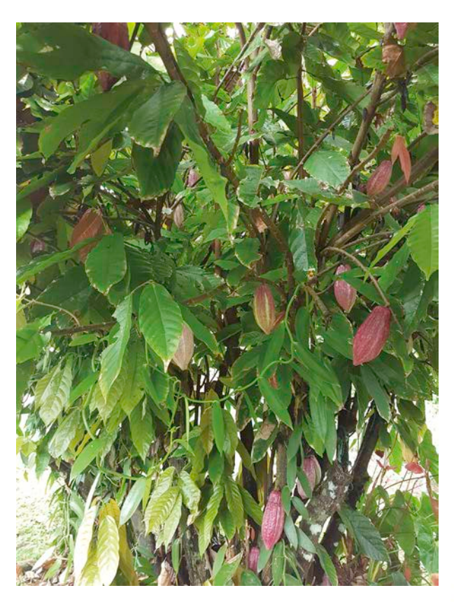
Very beautiful cocoa tree. The pods have a nice coloring.