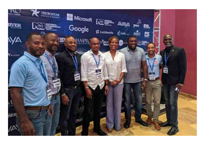
The TEECA and OECS delegation from the ICT sector participated in the Tech Beach Retreat in Jamaica.

As a project partner, I got involved in the first edition of a Caribbean songwriting camp in Martinique where I had the opportunity to spend 5 full days with the TEECA beneficiaries from the music industry as well as artists and producers from Martinique, Saint Lucia, Saint Vincent and international producers from the UK and the USA.