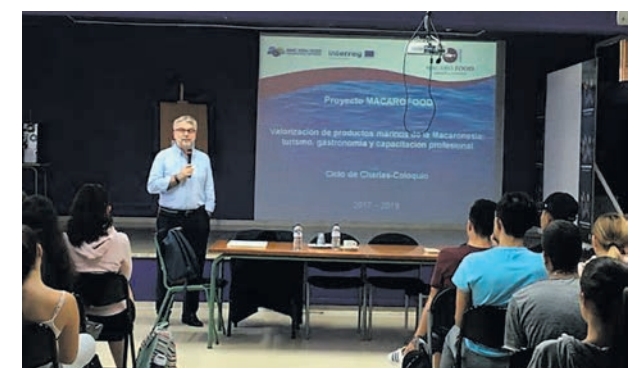
Kick-off meeting of the Macarofood project.