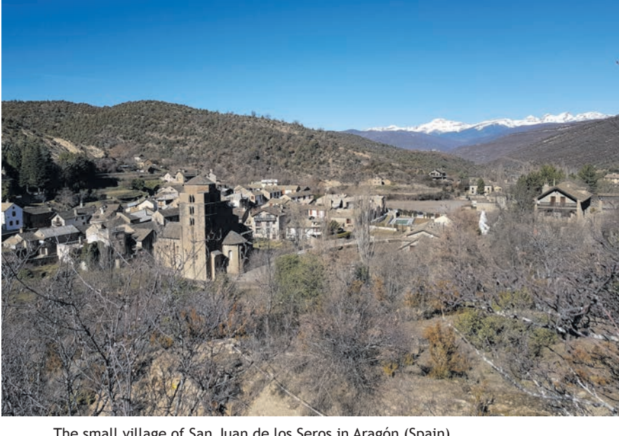
The small village of San Juan de los Seros in Aragón (Spain).

policies to be implemented to mitigate the negative effects of climate change in the region. Gathering knowledge on climate change adaptation is a key measure to help citizens face this challenge and socioeconomic sectors tackle its effects.