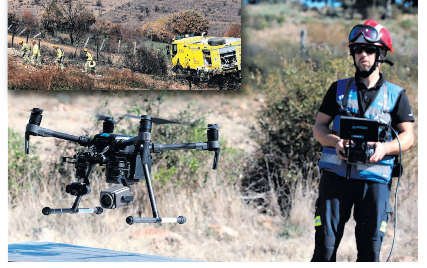
Guided equipment exploring the cooperation area in the framework of ARIEM 112.

a forest fire. In fact, it is an ongoing project that continues to develop since its implementation. Cross-border cooperation is real and effective.