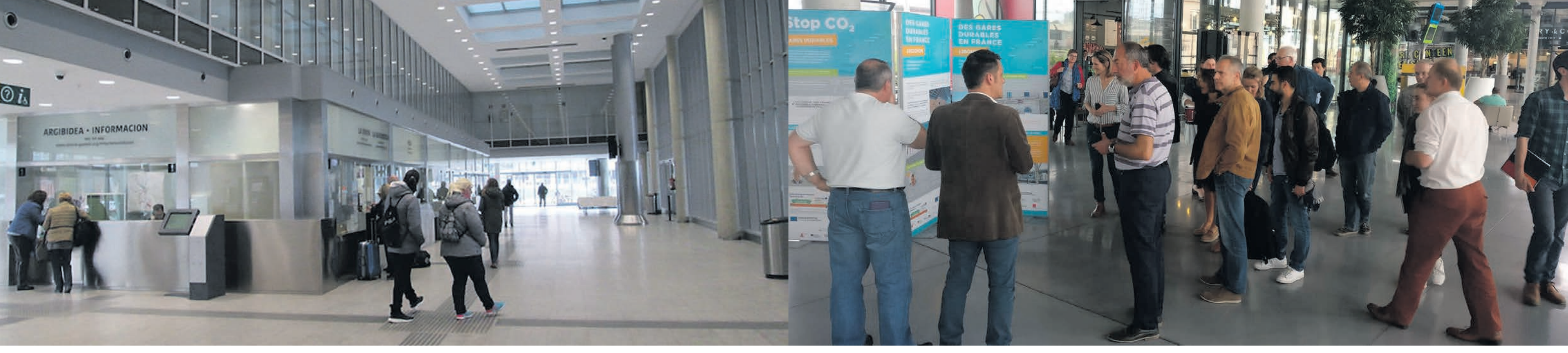
Victoria-Gasteiz bus station.