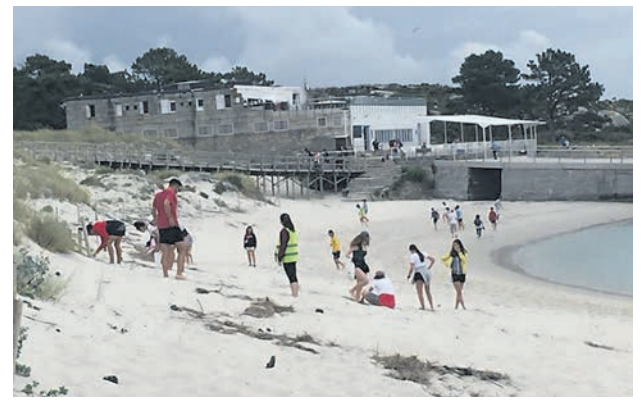
Young volunteers cleaning the beach during a work-camp.

This project is part of the Atlantic Youth Creative Hubs (AYCH), an initiative for integrating best practices and knowledge, supporting young talents and their education, entrepreneurship and employability through the development of creative