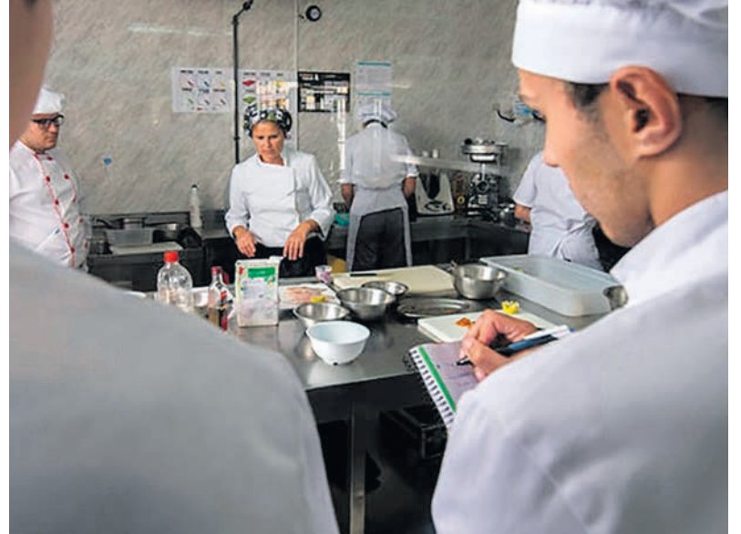
High School 'Faro de Maspalomas'.

Some examples of this project are biological and environmental studies on tunas and emerging species, as well as proposals for rational fisheries management. It also creates an occasion to share good practices and stimulate synergy between actors in the marine field.