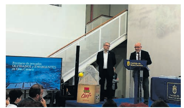
Presentation by the representatives of the Canary Islands government.