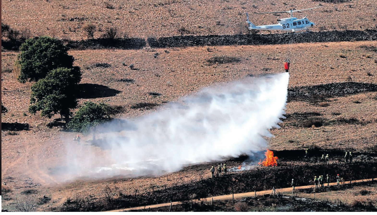
Equipment flies over the cooperation area between Portugal and Spain

As a volunteer for the Interreg Spain-Portugal (POCTEP) programme I have seen that cross-border cooperation is a key element to the development of many European territories, enhancing the