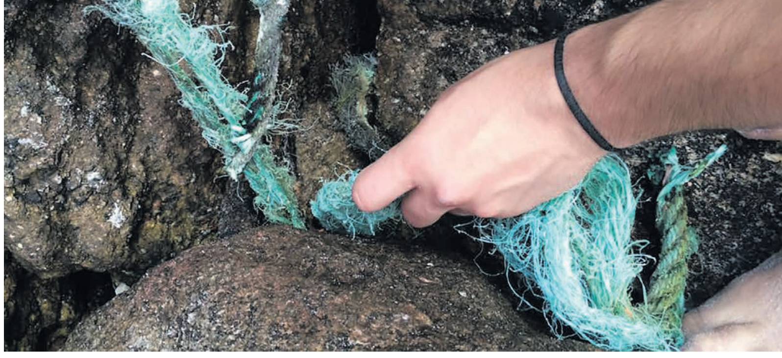
One recurrent example of marine litter: net fishing.

This is done through activities to benefit conservation of seas and oceans with a special emphasis on the problem of plastic, fulfilling the commitment that the entire partnership has acquired in relation to the circular economy and on the basis of starting this common project.