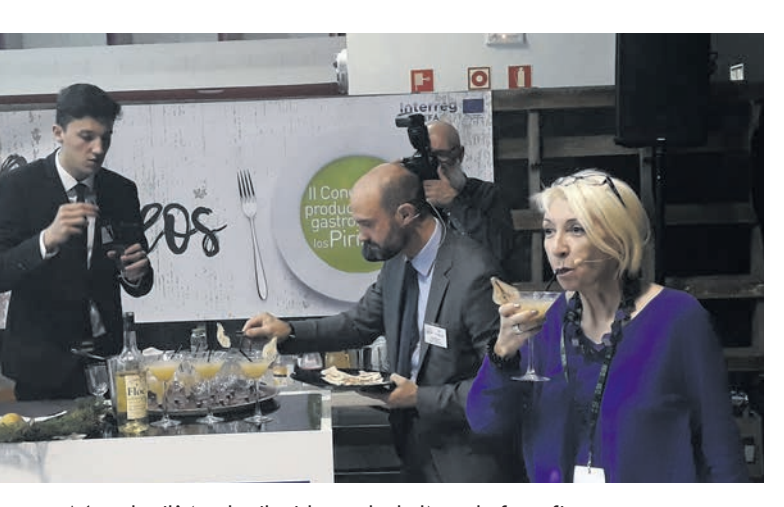
A 'mocktail' (cocktail without alcohol) made from fir syrup (home-made recipe).

What usually happens is that apart from the locals outsiders don't know anything about the rich gastronomy in a geographical area. And this also happened to me when I moved to Jaca. Little by little, I discovered products from the Pyrenees area, both on the French and Spanish sides. This region is so diverse and varied! Showing this diversity is one of the goals of the 'Made in Pyrenees' project, which organises the 'fair-congress of products and gastronomy of the Pyrenees'. Its second edition gathered over a single weekend, more than eight thousand people, who visited the more than 30 local food producers' stands and participated in conferences and cooking workshops.