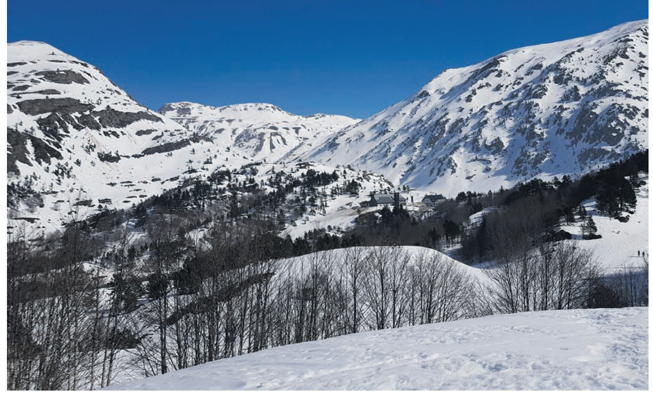
A view from ski station Candanchu, threatened by the decrease in snowfall in the Pyrenees.

long walks in summer, the fun days spent skiing in winter. Being very attached to this region, I was surprised to learn that mountain areas are particularly sensitive and vulnerable to climate change - and therefore particularly happy to volunteer for a project which strives to mitigate its effects in the Pyrenees.