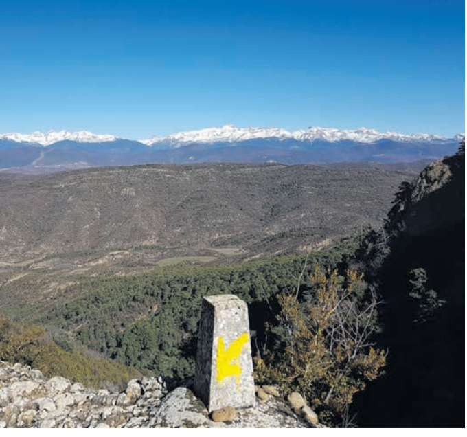
The Pyrenean range seen from a hiking trail near Jaca (Spain).