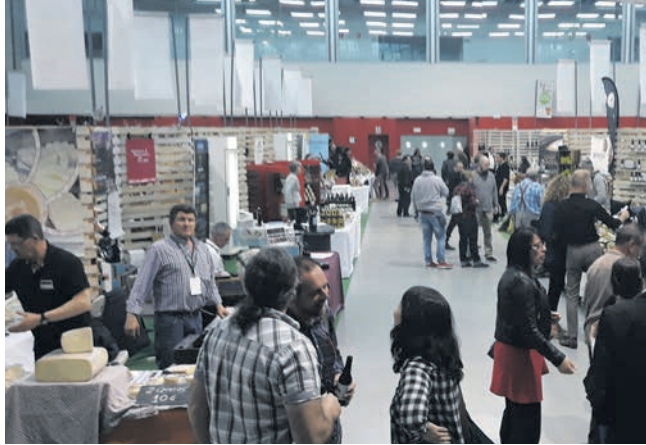
Hydromel, cheeses, beers, sausages, honeys, oils, pâtés, and biscuits.