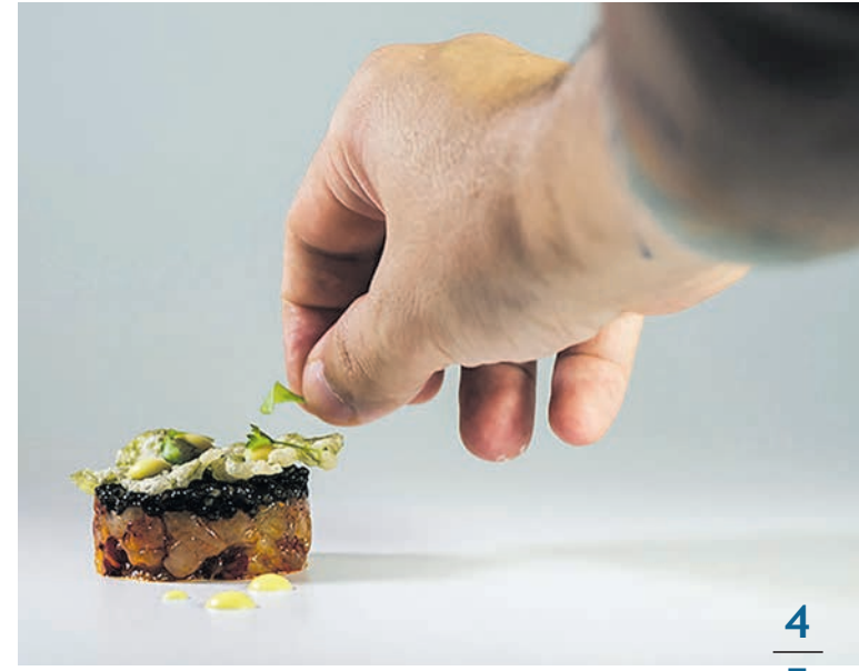
The book of recipes from the island.

The Macarofood project collaborated in the 'Tuna Fair of Mogán' by presenting its results and findings, while also offering a blind tasting of tuna for 40 guests. Mogán is in the south of Gran Canaria and benefits from a nice flowered harbour. The scientific