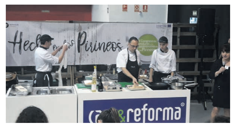
'Poule noire' (black hen) of Astarac-Bigorre, a high breed with the opposite rhythm of industrialisation with high yield.

The proximity of the market-gardening plains of Huesca (Spain), with its rich cultural lands, allows local producers to have access to raw materials of excellent quality. In addition, the meadows and pastures of the Pyrenees, a delight for the eyes too, has grass of rare purity, free of pollution. The inherited traditions have gradually enriched each