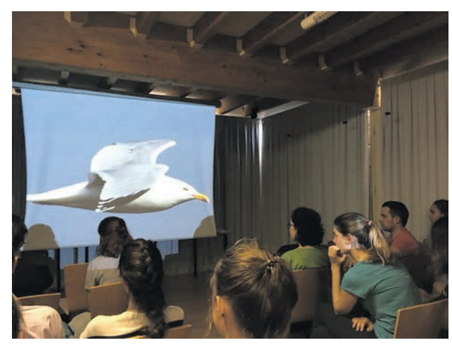
Sensibilisation on the biodiversity of the island.

and technological skills. It brings together four countries: Portugal, Spain, France and the United Kingdom (UK).